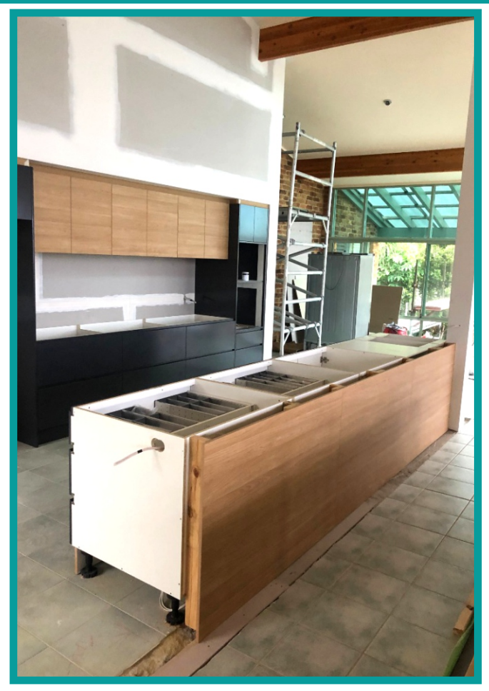
With the old kitchen gone we built a new wall creating an area for this huge pantry