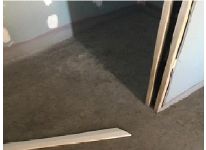
Figure 6: Sand cement bed