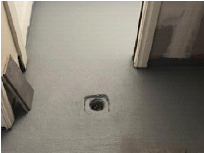
Figure 5: Waterproofing over the sand and cement bed

Notice the floor waste has been recessed? This allows the tilers to install a smart tile floor waste, which blends into the tiles. These are our preferred waste; we use them whenever we can.