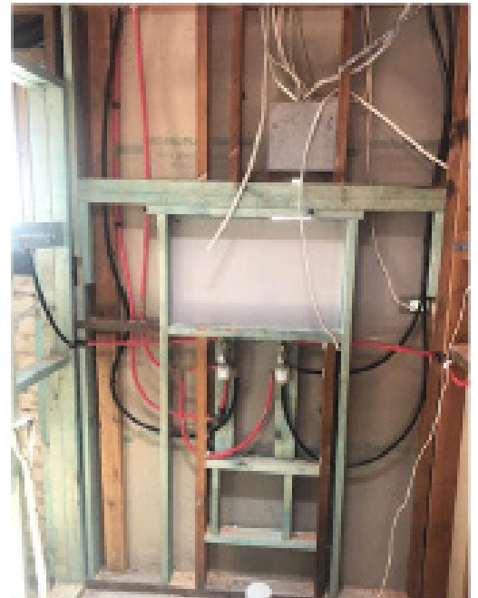
Figure 3: Electrical Works

The carpenters need to prepare the frames and floor for the plasterer. The walls need to be straight so that the tiles sit nicely on the wall. Many old homes need a lot of frame prep as they are often out of plumb.