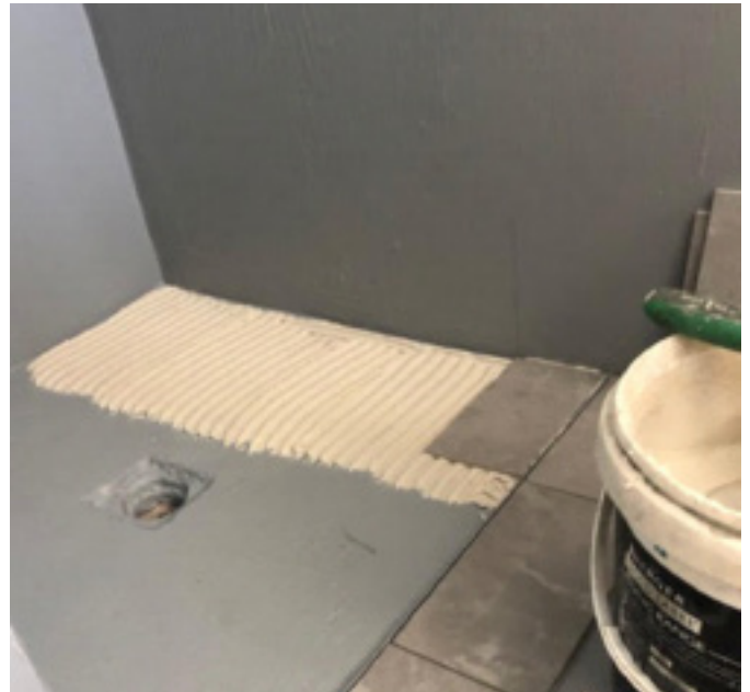
Figure 8: Shower recess tiles being laid on the sand-cement bed

Shower screens can take 7-10 days to be manufactured, and this does tend to slow the renovation down.