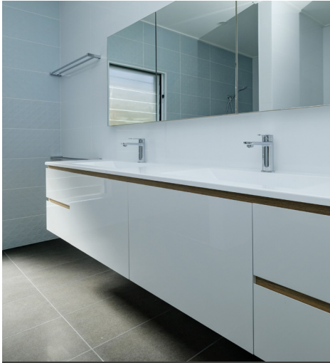
Figure 9: A wall-hung vanity

The shower recess below has the niches in the wall for your footrest and also a place to store your bottles.