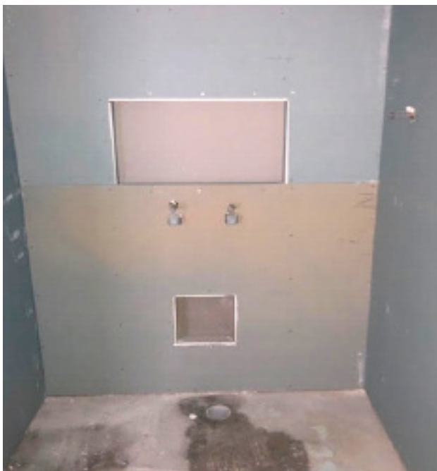
Figure 4: Preparing the room for waterproofing

The plasterer comes in and sheets the walls and ceilings to prepare it for waterproofing.