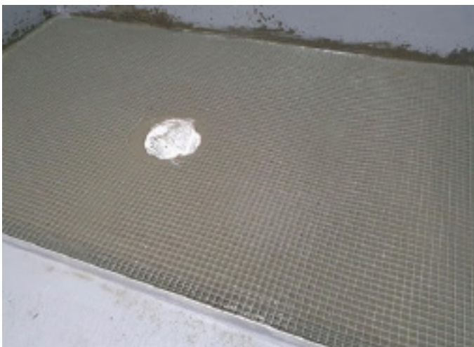
Figure 7: Wire reinforcement in the sand bed

The next step is to install a wire reinforcement in the sand-cement bed. This is only done when working with timber floors. It is an extra precaution we take to avoid cracking and movement as time goes on.