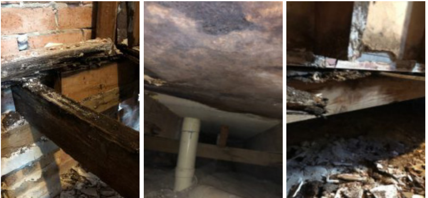
Figure 2: A Damaged Floor

This ensuite bathroom below in figure 2 had extensive damage. The shower was about to fall in with the client along for the ride.